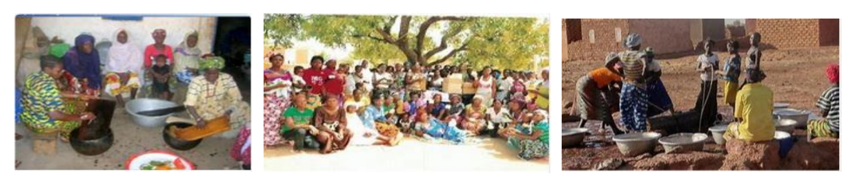
Women's Group: G1

The multidimensional classification of groupings was carried out according to four criteria, each multiplied into sub-criteria and presented in Table 1. Data for the six groupings are presented in Table 2.