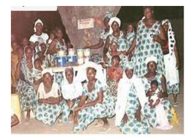
Women's Group: G4