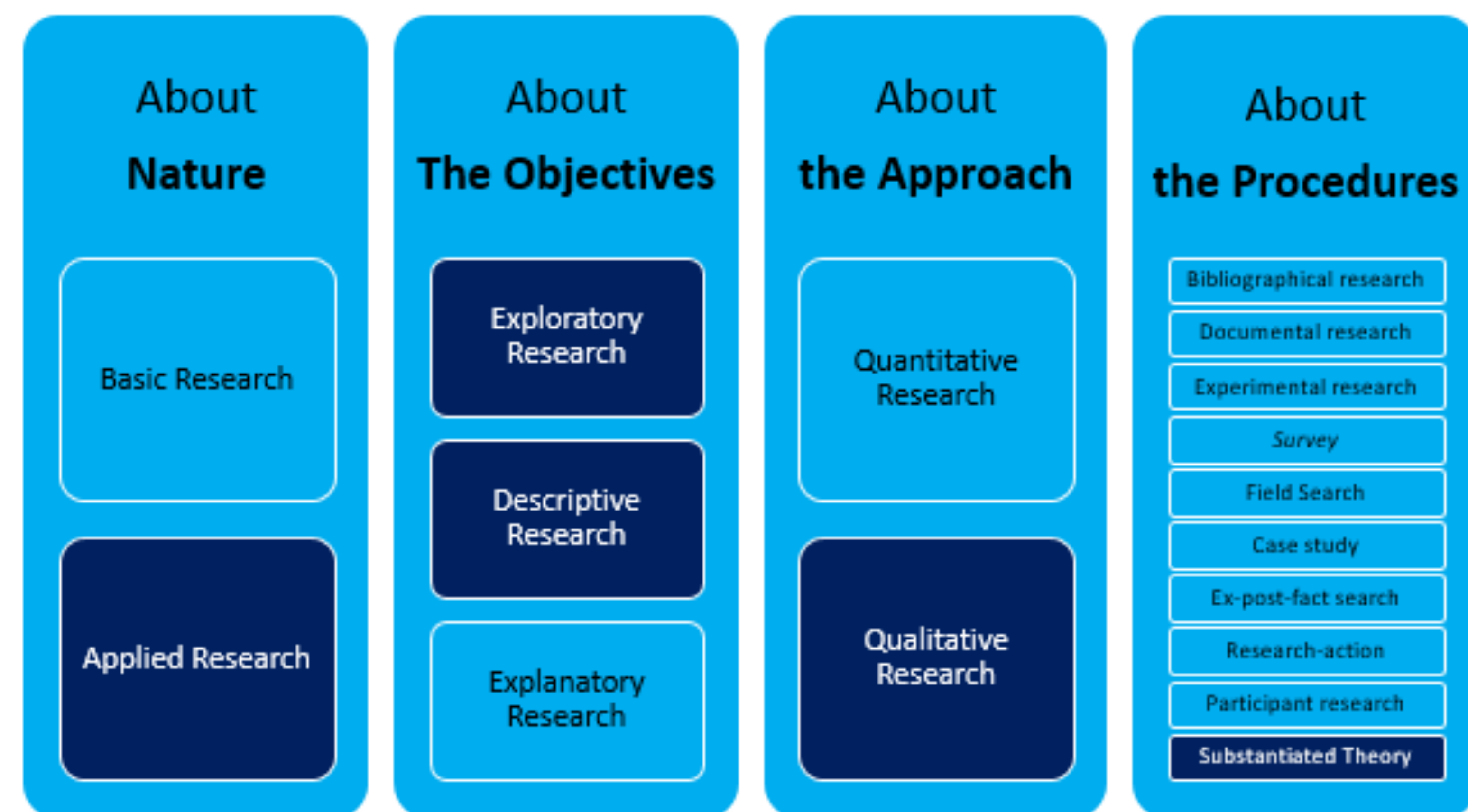
Figure 1: Methodology used