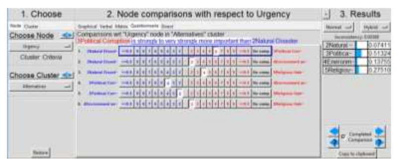
Figure 3: The analytical hierarchy diagram