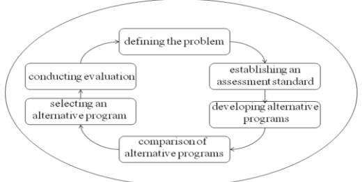
Fig. 1. Diagram of collaborative planning.

The vast amount of area covered by the water source catchments, its constitution of multiple jurisdictions, as well as the involvement of multiple management units raises the question of how to integrate a reasonable development strategy for preservation sites. However, relying on the method of collaborative planning to supplement strategizing is a necessity, as well as being advantageous for the government to configure the most justifiable configuration for limited resources. Generally speaking, the collaborative planning procedure includes six stages in Figure 1: (1) defining the problem; (2) establishing an assessment standard; (3) developing alternative programs; (4) comparison of alternative programs; (5) selecting an alternative program; (6) conducting evaluation.